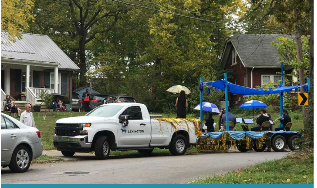
LexPhil in Your Neighborhood Mobile Concert - Idlewild Ct. in North Lexington