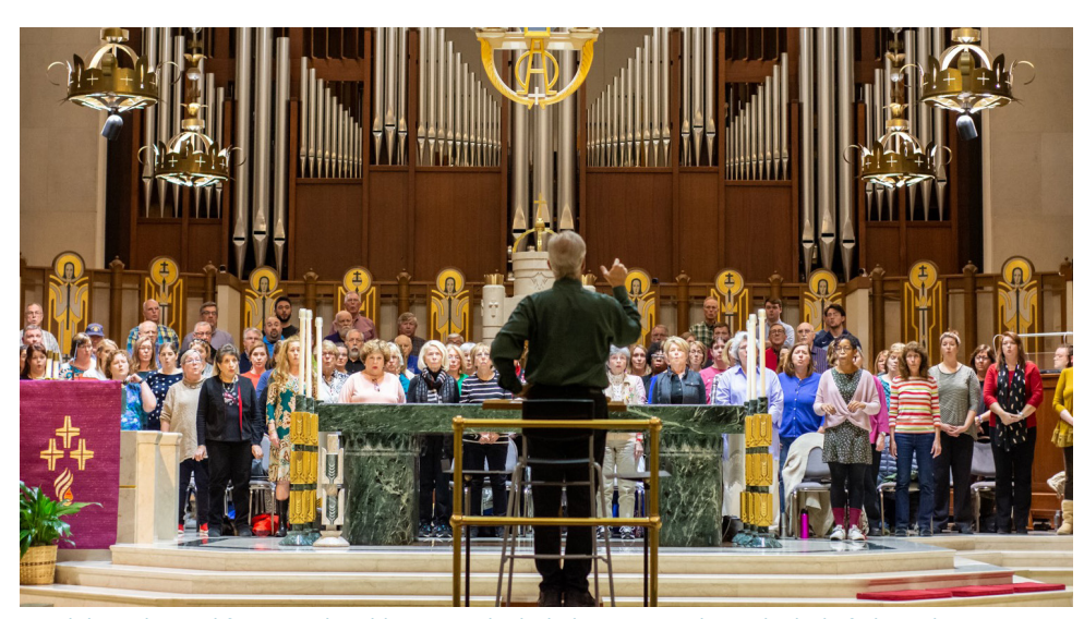
LexPhil in rehearsal for a nearly sold-out A Cathedral Christmas at the Cathedral of Christ the King.

Music education continues to be central to LexPhil's mission and we offer extensive education programs for children and students, directly impacting over 10,000 young people this year. Through our flexible "Music Builds" education platform, LexPhil works with numerous schools in central, southern and eastern Kentucky. Many students continue to have their