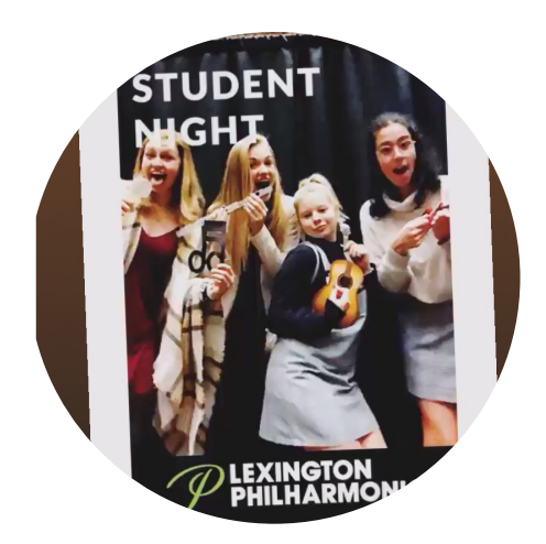
Lexington Philharmonic Student Night, November 2019.

February 2020's concert was Subscriber Appreciation Night! LexPhil developed a small gift (chocolates, a sticker) for subscribers to pick up at the concert. Board members volunteered at Blue Beethoven on Friday, February 21st to greet, thank and distribute 'thank you' items to subscribers who approached the marketing table.